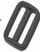
50mm Sliplok slide