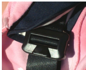
40mm Adjuster Buckle