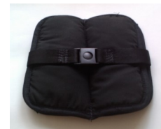
Padded Cross Strap

Model 28 can be used on both single & bench seats.