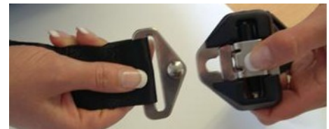
Steel Safety Buckle

Model 28 harness has passed dynamic Impact testing to ISO Draft Standard 10542 Pulse and complies with the VSE 87/1 voluntary code of practice.