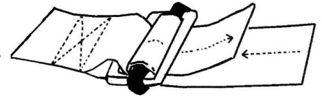
50mm Aluminium Bar Buckle