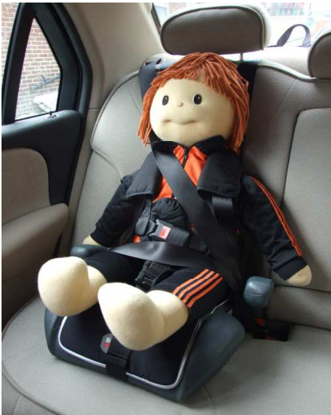
Illustrating one of our harnesses fitted in conjunction with the existing vehicle safety belt.